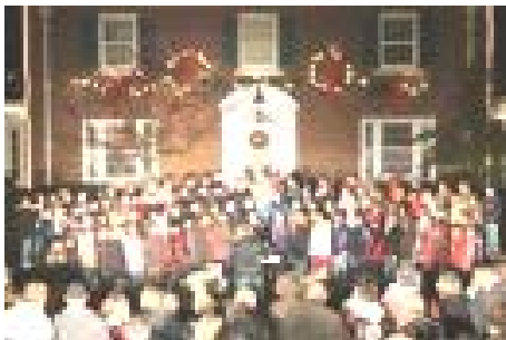
4 TH GRADERS PERFORM AT GRILEY HOUSE